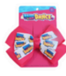
HAIR ACCESSORIES $10