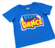
T SHIRT $35