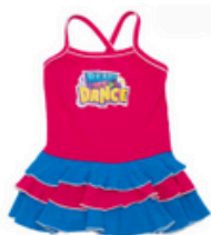
TUTU FRILL DRESS $55

*The minimum uniform required is either the Tutu Frill Dress OR T-Shirt & Shorts (there is no requirement for boys or girls to have to wear one or the other)