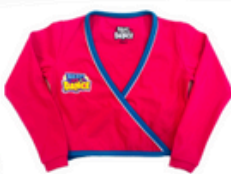
CROSS OVER $45